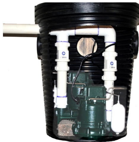
Basin with two Zoeller Sump Pumps and all PVC connections